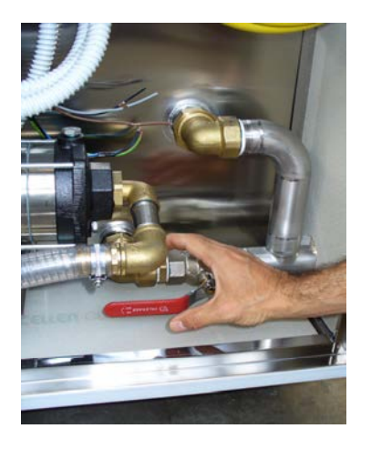
Empty the water tank

Every 2 months, with oven and unit off, perform an accurate maintenance of the unit.