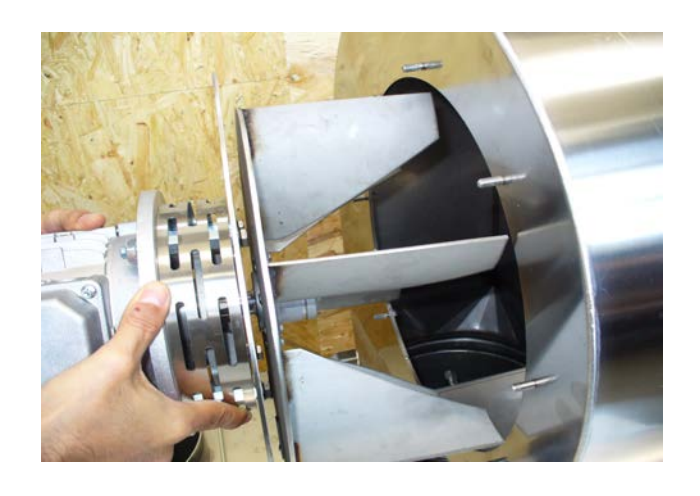
reposition the fan into the stainless steel spiral