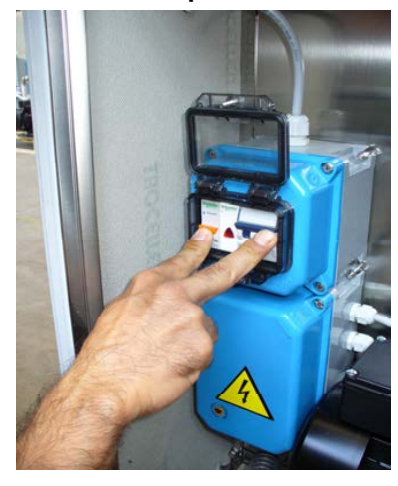
Switch the machine on