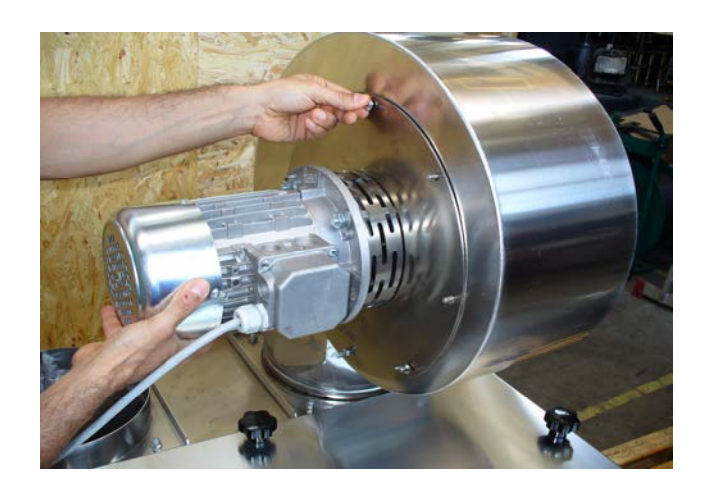
screw the butterfly bolts in order to block the fan on the stainless steel spiral.