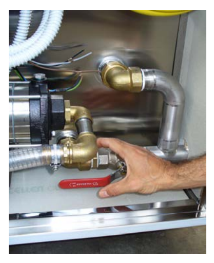
Once the lever has been turned water level will start to lower until the tank is empty