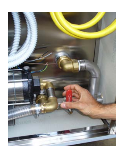
After cleaning the water tank close the auxiliary tap and turn the control lever in the original position as showed in the picture