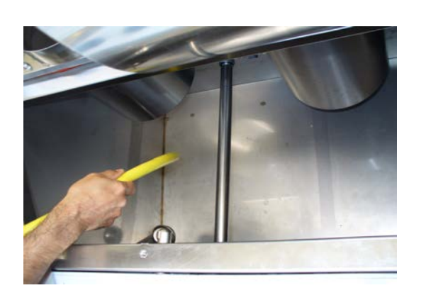
Clean the tank with a jet of water