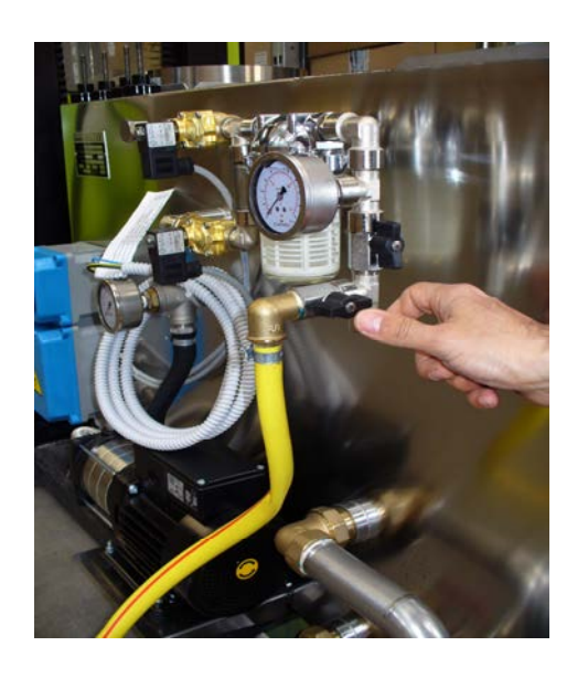
Open the auxiliary tap connected to the hose