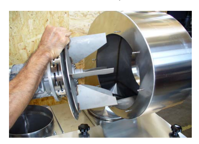
Remove the stainless steel fan

Unscrew the butterfly bolts to remove the motor coupled to the fan from the stainless steel spiral